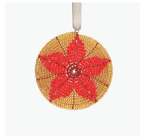
BLOSSOM OF HOPE