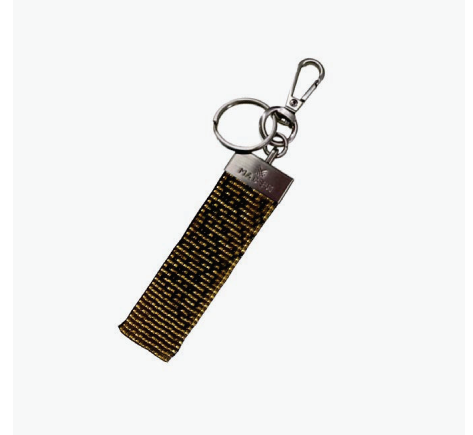
GOLD BEADED KEYCHAIN