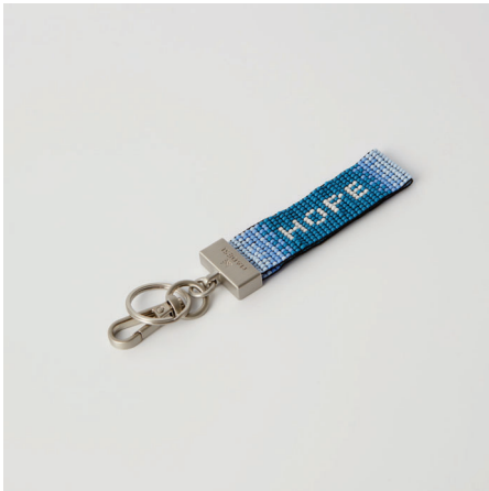
HOPE KEYCHAIN *PREORDER