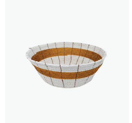
BEADED BOWL IN GOLD