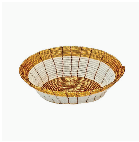
BEADED OVAL BOWL IN GOLD