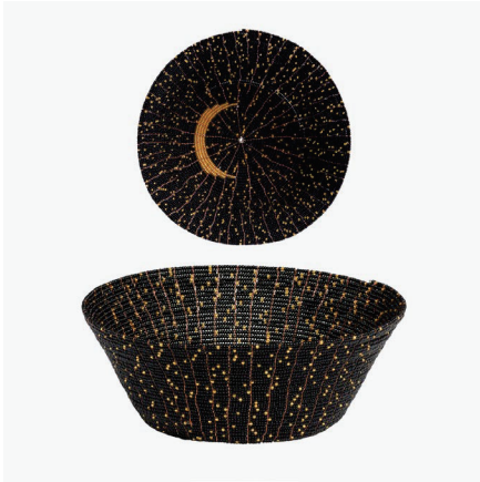
BEADED CRESENT MOON BOWL