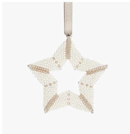
STAR OF UNITY