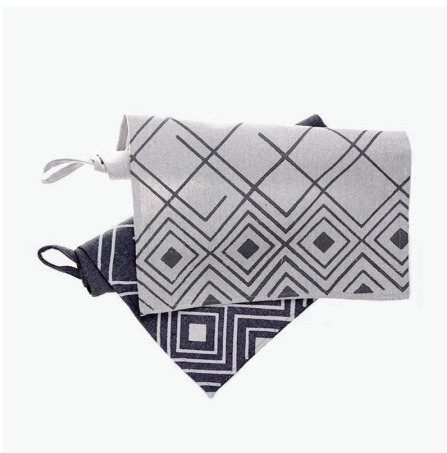
BLOCK TEA TOWELS - SET OF 2